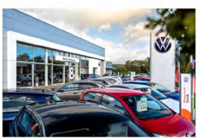
A family run business with elegant touches from some of the biggest and best car brands on the market. Every visit to our Martins Group franchises is a pleasurable experience.